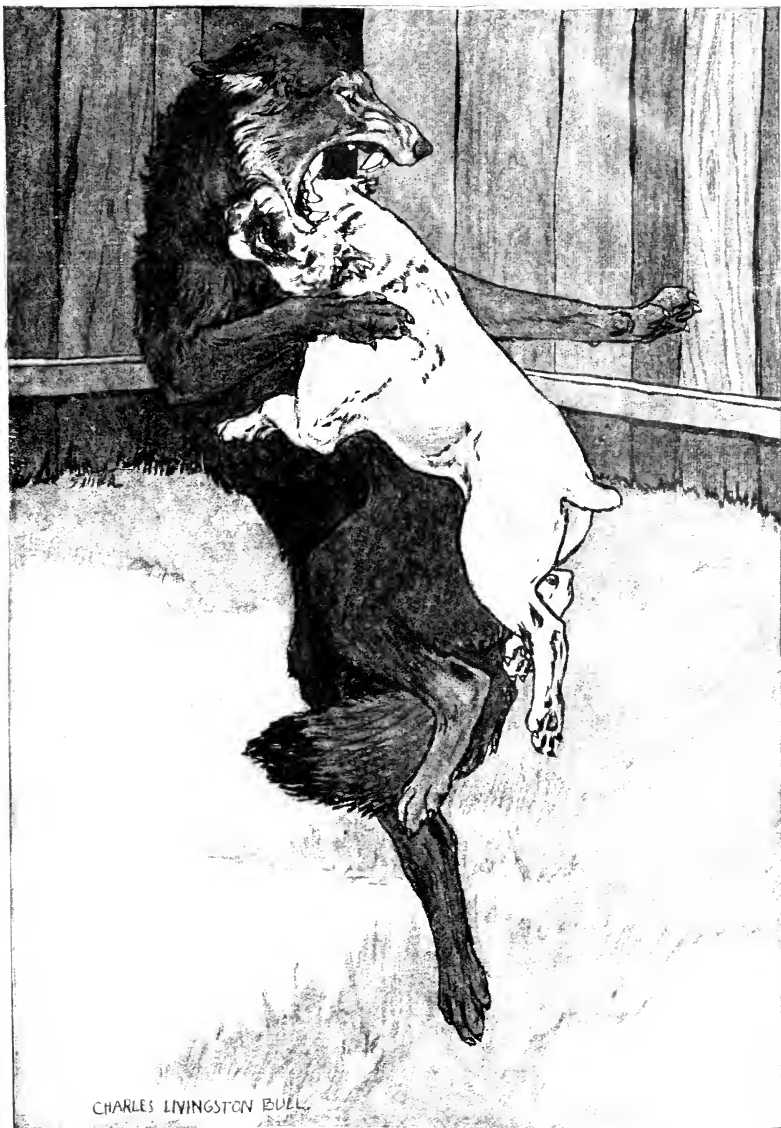
“White Fang tore wildly around, trying to shake off the bulldog’s body.”